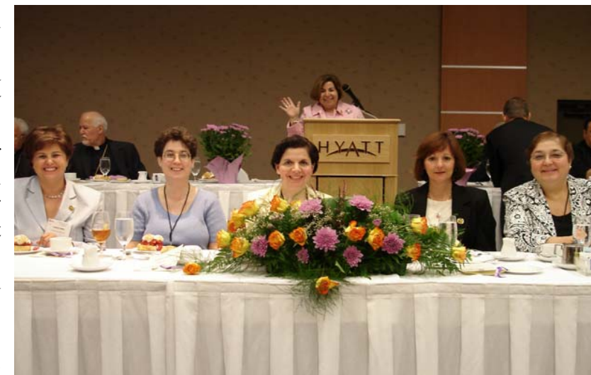
Outgoing Officers of the North American Board of the Antiochian Women 2003 - 2005