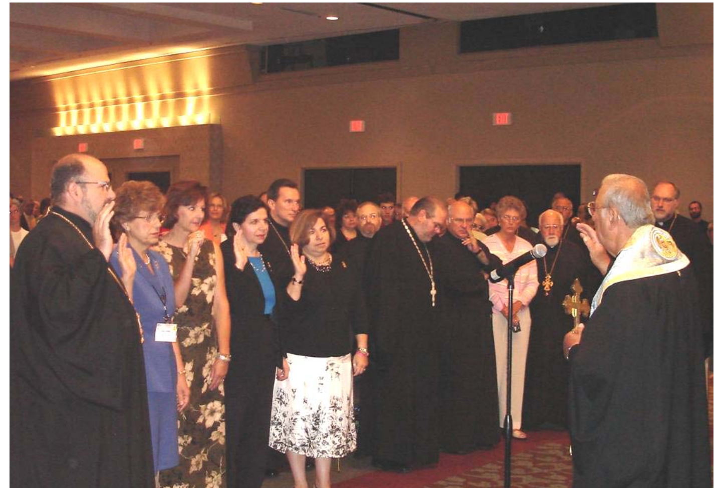
Induction of the 2005 - 2007 North American Board of the Antiochian Women

Antiochian Orthodox Christian Women of North America A Sisterhood Serving Christ Through Serving Others