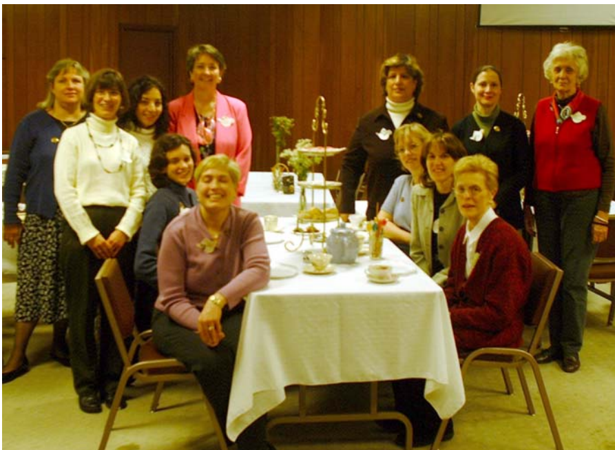
AWE enjoying a tea following a spiritual Retreat

Finally, we are endeavoring to make a Visit to all 47 parishes and missions in AWE. The visits range from very informal gatherings to full day spiritual retreats, depending on the desire of each parish. These visits help us to know what they are all about, but also allows us to share their good ideas with others and trouble shoot any problems. Experience has shown that most parishes start out telling us they are not doing anything really special, then they slowly begin to list of the things they have done for years that seem mundane to them---but amazing to us. One group uses special electric drills to core cabbage for 10,000 cabbage rolls. Another parish has held a pasta supper for their community every week for many years. It is especially popular with area seniors since $6 gets you a complete meal including a choice of about 5 kinds of pasta and several sauces served on glass plates at lovely settings. We were amazed to hear that it nets this parish about a $1000. a week! Other parishes have adopted children or schools overseas. One church has become the only place that the retarded adults from area group homes ever get to go out to when they serve them a Thanksgiving meal. Another parish does tutoring for school kids. The list of ideas is as amazing as the ladies that we have met in our parishes. Thus we developed our names and slogan : AWE- Antiochian Women of the East: In awe of our Creator and His work in us and through us.