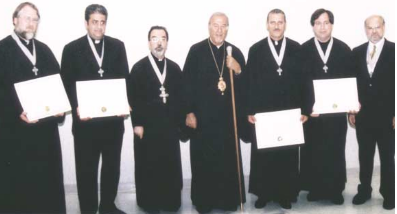
The presentation of the Doctor of Ministry Degrees

God is the Lord and has revealed Himself to us. What is known about the state of blessedness in which God dwells is that it is eternal life, inexpressible beauty, infinite wisdom, perfect joy. It is also experiential . The saints demonstrate that one profound quality of God’s blessedness is that His creation may share in it. Precisely, we have been given the gift of participation . And our participation in God is accomplished entirely by our participation in Christ.