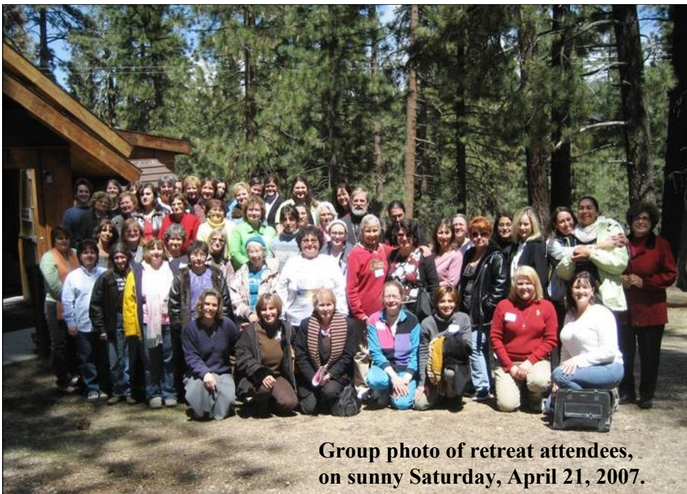
Group photo of retreat attendees, on sunny Saturday, April 21, 2007.