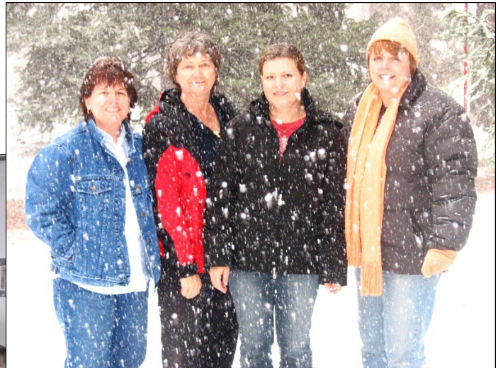
They had walks in the snow