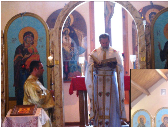
participated in the Divine Liturgy and partook of the very Body and Blood of Christ....