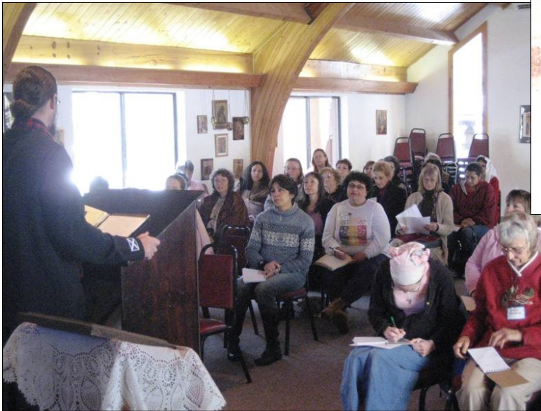
Received teaching and nourishment for their souls and spirits...