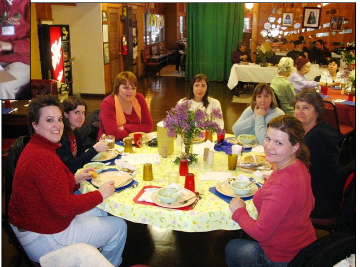
nourishment for their bodies while getting re-acquainted with old friends and establishing new ones.....