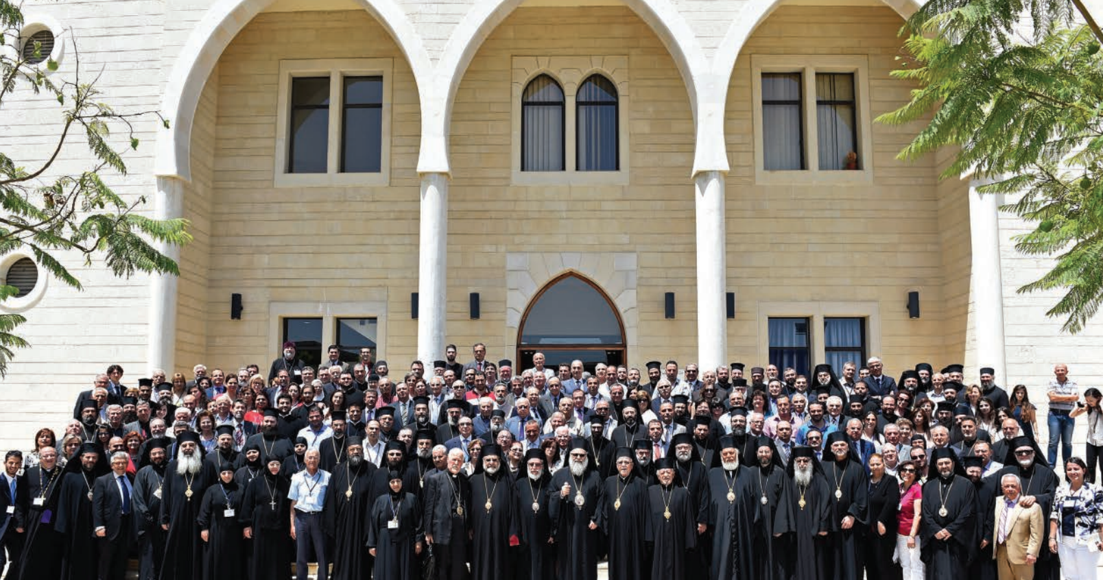
Unity Conference attendees from all over the world

their lives with the name of Christ. They in turn anoint her by their love and giving, by their longing and sacrifice in standing up for its concerns. Today we all bow down to the Lord Jesus our Creator and Savior in the time of crises, who allowed us to meet here today in Balamand, in this Antiochian University, in Koura, the bride of Lebanon.