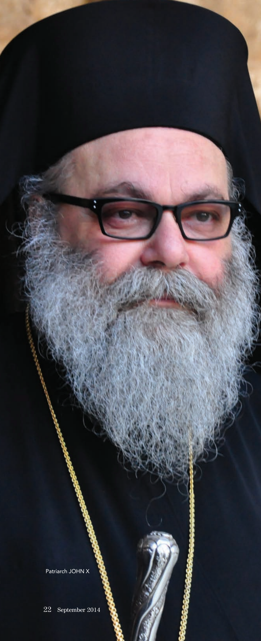
Patriarch JOHN X

His Eminence for all his efforts and services for the Archdiocese. They prayed to the Lord God to strengthen him and give him many blessings in his old age. Furthermore, His Beatitude gave the Synod Fathers a detailed presentation on the visit he made to this Archdiocese, during which he met the faithful in the Kingdom of Bahrain and in the United Arab Emirates. In this visit, His Beatitude had the opportunity to see their pastoral needs and was able to meet with the leaders of their parishes. The faithful have shown their readiness to stimulate and strengthen the Antiochian Orthodox presence in these countries. In this context, the Synod Fathers decided to review the geographical composition of the Archdiocese, which was reconstituted as follows: