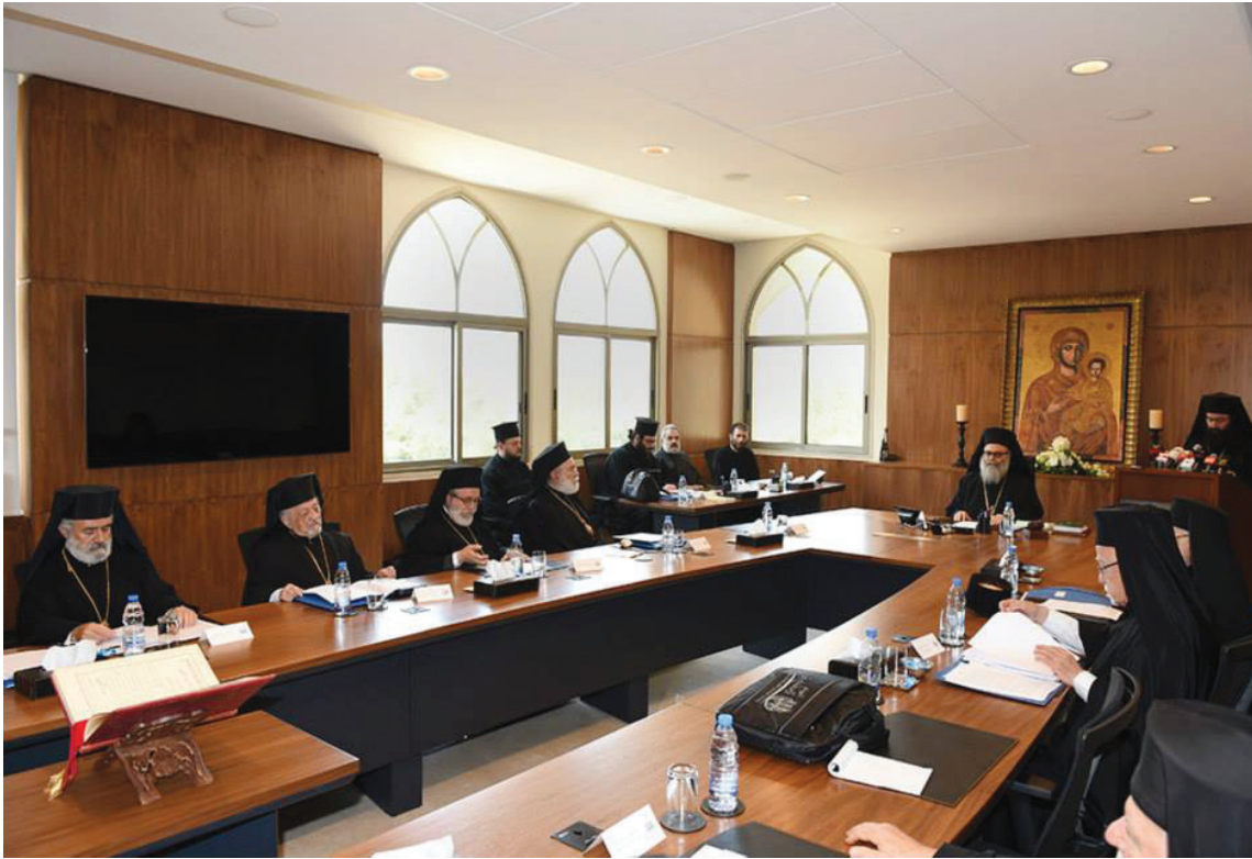
Holy Synod of Antioch meets at the Balamand. Patriarch JOHN X chairs the synod meeting.

The Synod Fathers reviewed the recommendations presented by the General Antiochian Conference held in Balamand between 25 and 29, June 2014. They offered thanks to the Lord