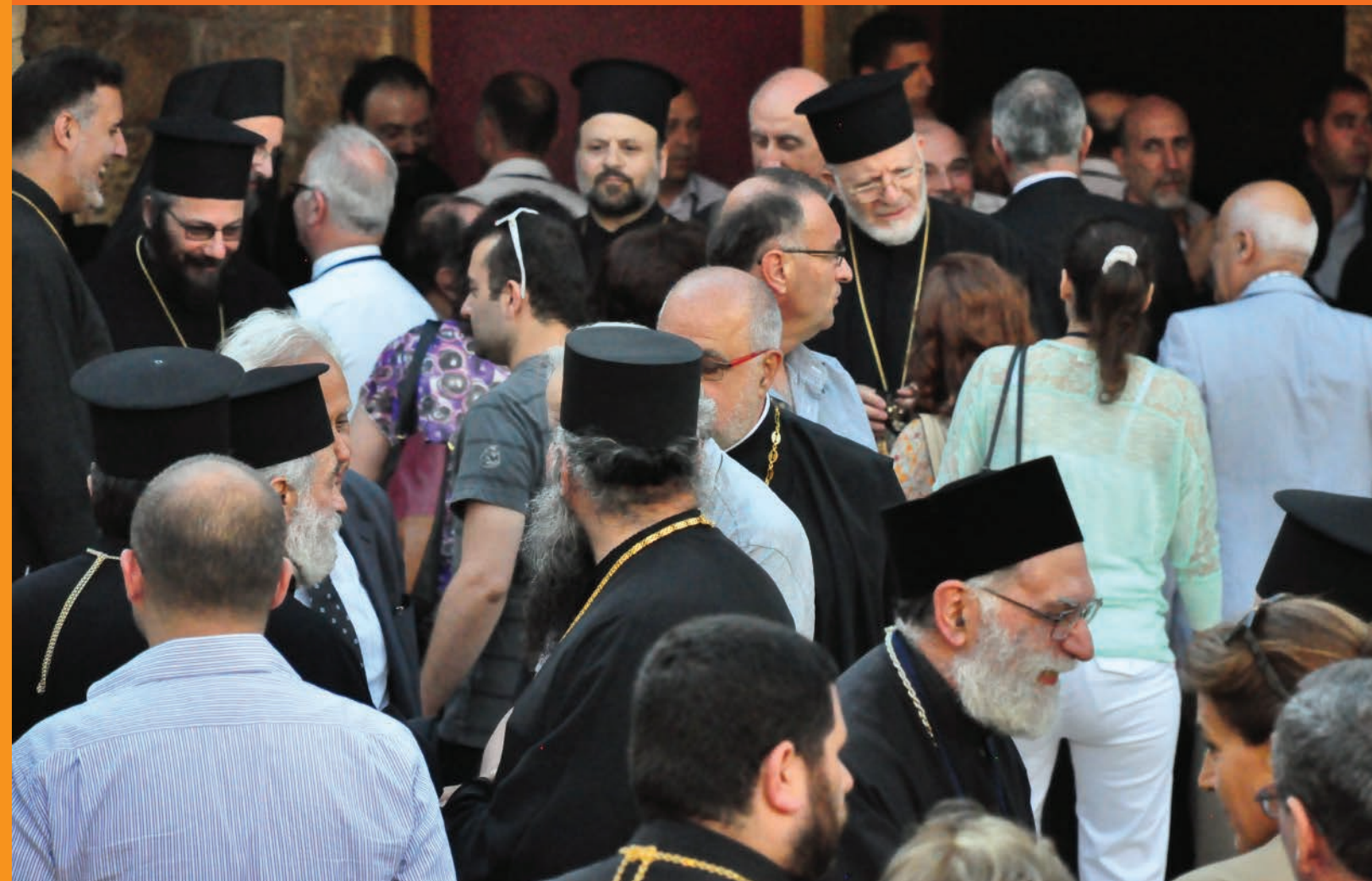
Delegates await the start of the Unity Conference

THE NORTH AMERICAN DELEGATION TO THE ANTIOCHIAN UNITY CONFERENCE