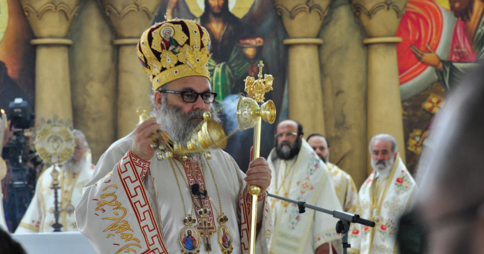
Patriarch JOHN X at Unity Conference Liturgy

Our Antiochian Orthodox Church is a vineyard in the true sense of the word. The vineyard spreads its branches outwards and they grow in a new land and flourish in new parishes and dioceses overseas, in the